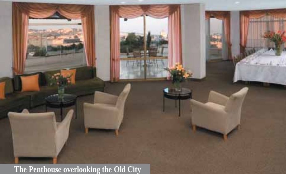
The Penthouse overlooking the Old City