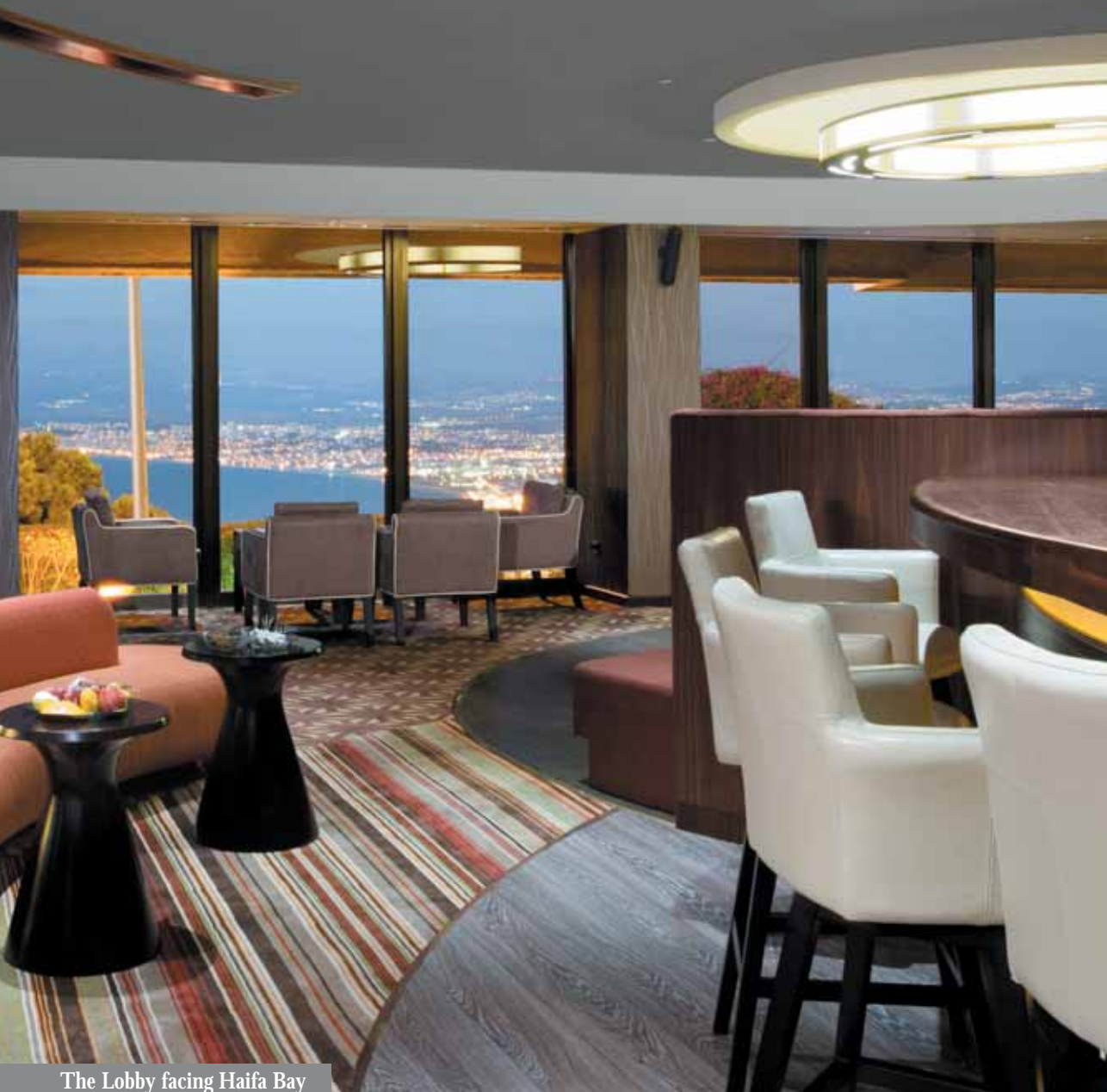
The Lobby facing Haifa Bay