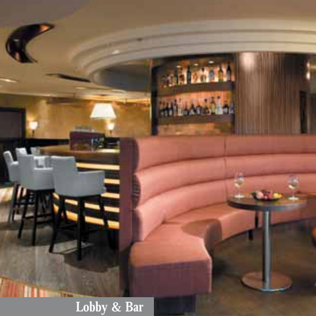
Lobby & Bar