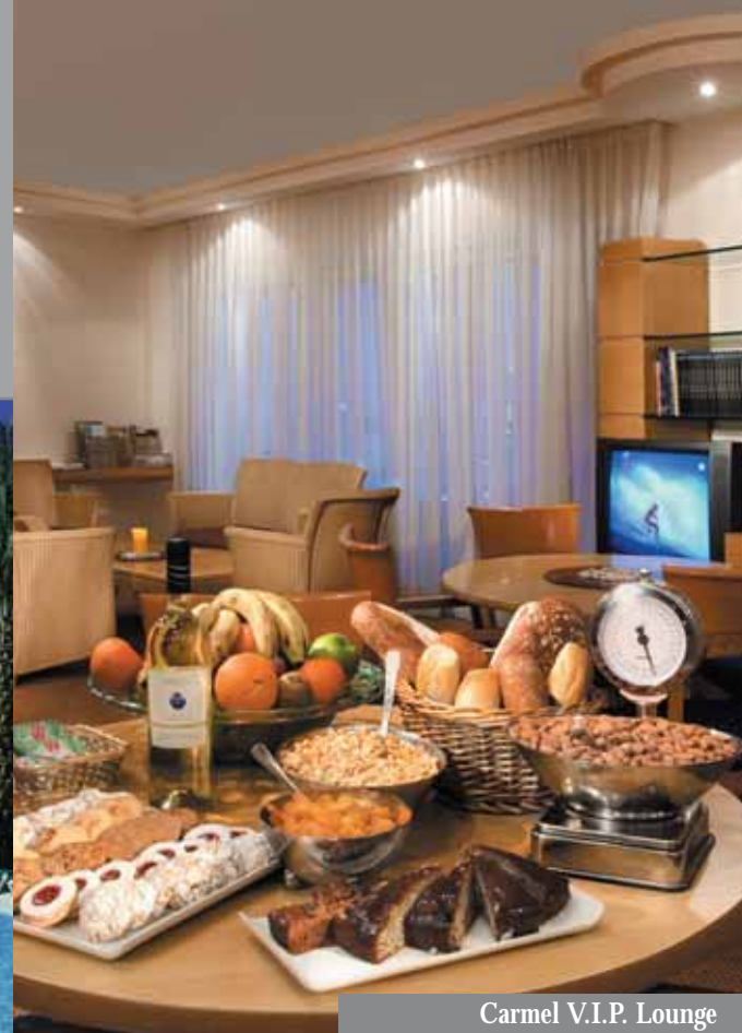
Carmel V.I.P. Lounge