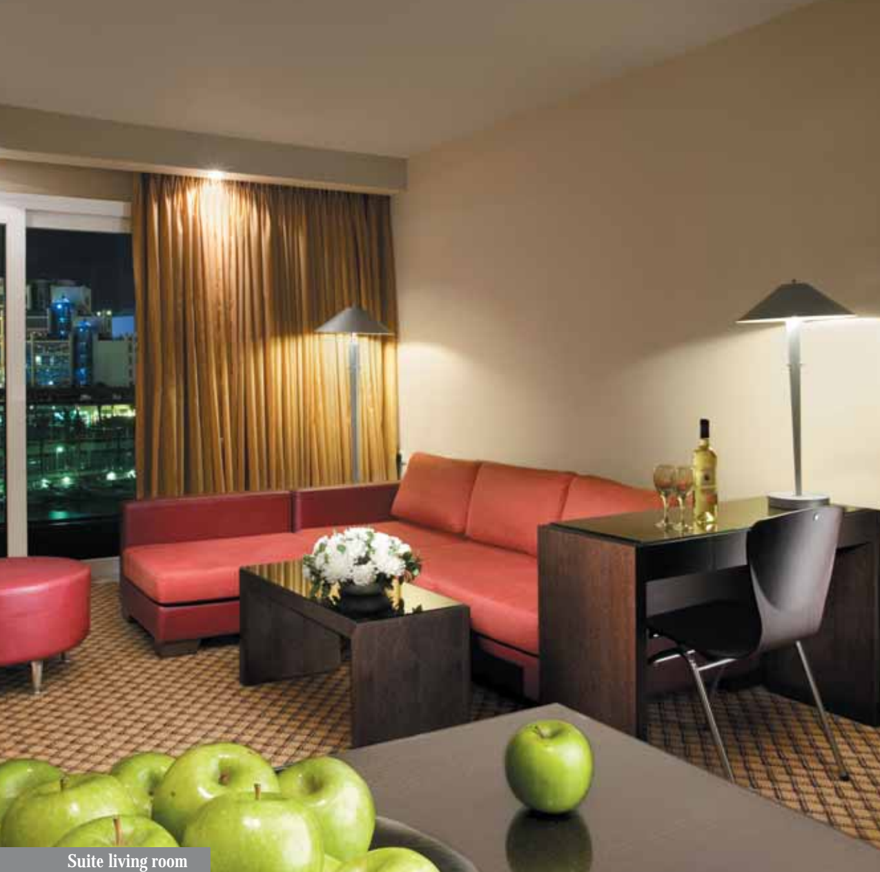
Suite living room