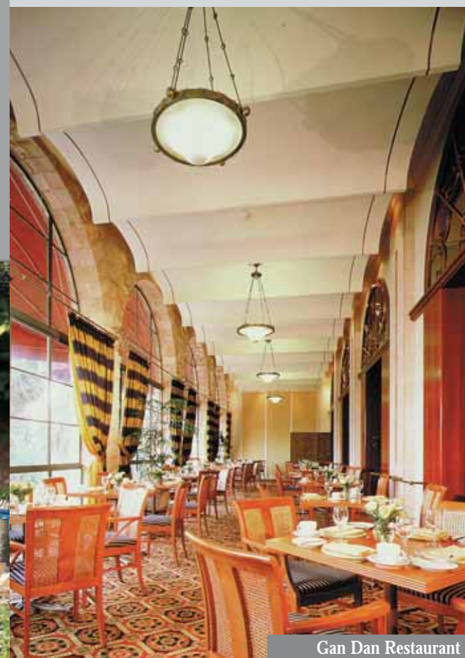
Gan Dan Restaurant