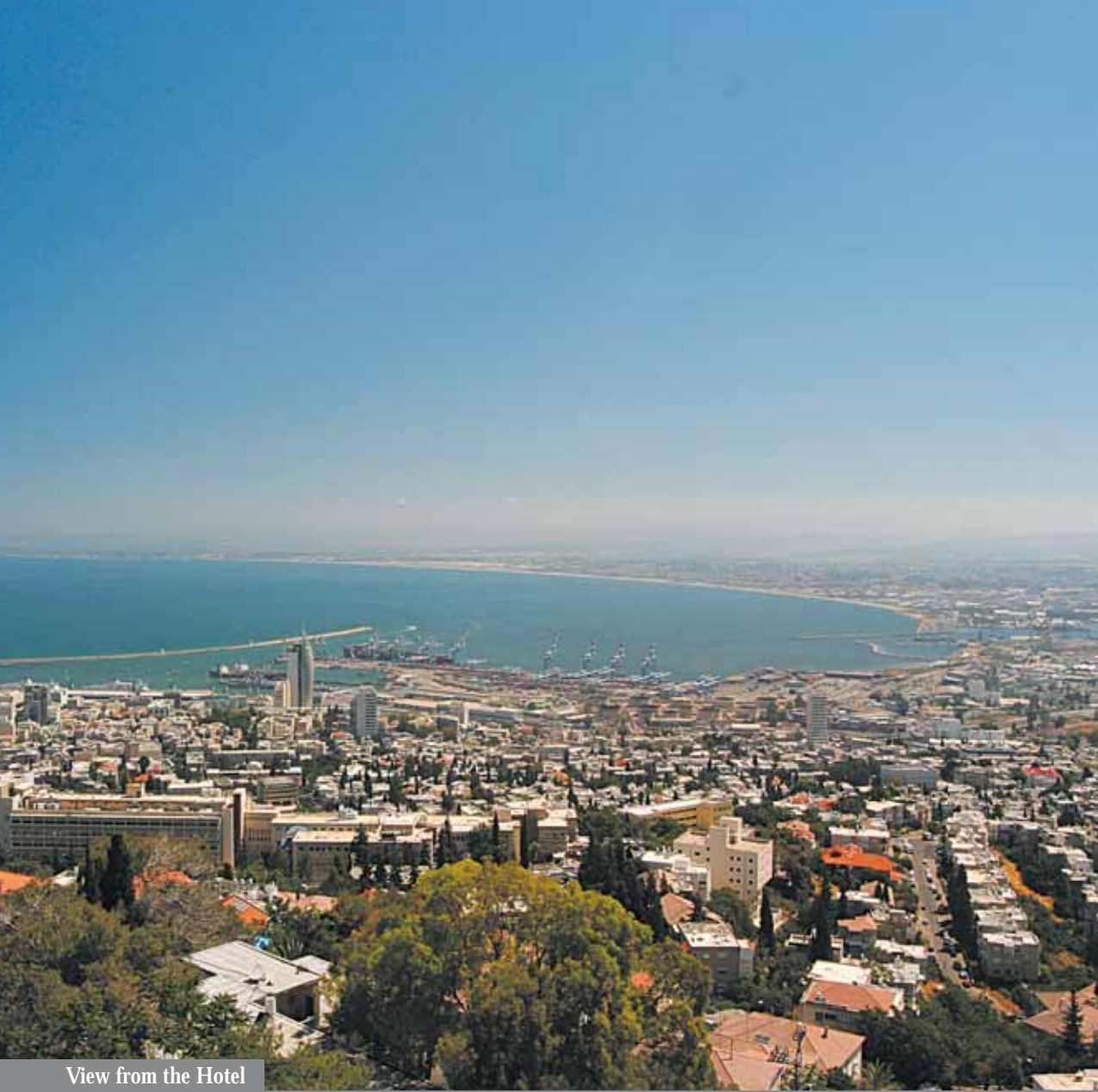
View from the Hotel