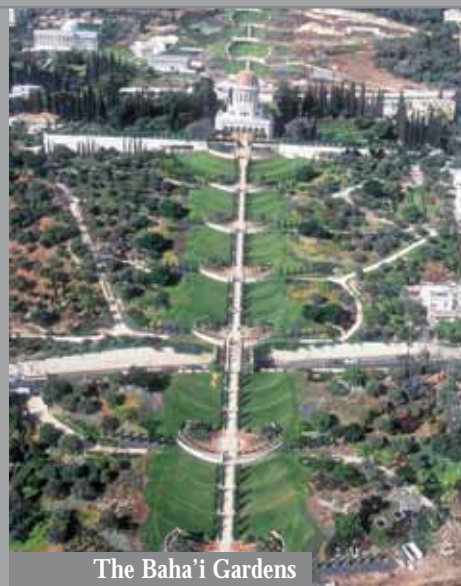
The Baha'i Gardens

Guest rooms with Cable T.V., Wireless Internet access in rooms and public areas, (fax upon request), safe, minibar, hair dryer, bathrobes. 24-Hour room service. Free Parking. Complimentary daily newspaper. Express check-in/out. Free guided bus tour every Saturday to historic sites and attractions.