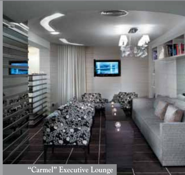
"Carmel" Executive Lounge

Free guided tour every Saturday to historic sites and attractions.