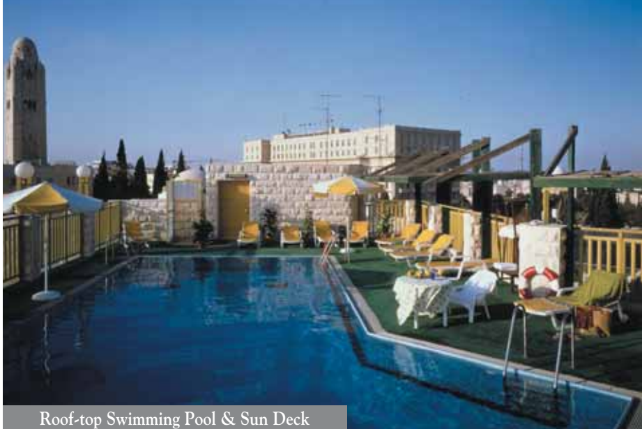
Roof-top Swimming Pool & Sun Deck