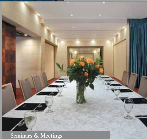
Seminars & Meetings

Meeting, party and function space available for 10 to 400 persons.