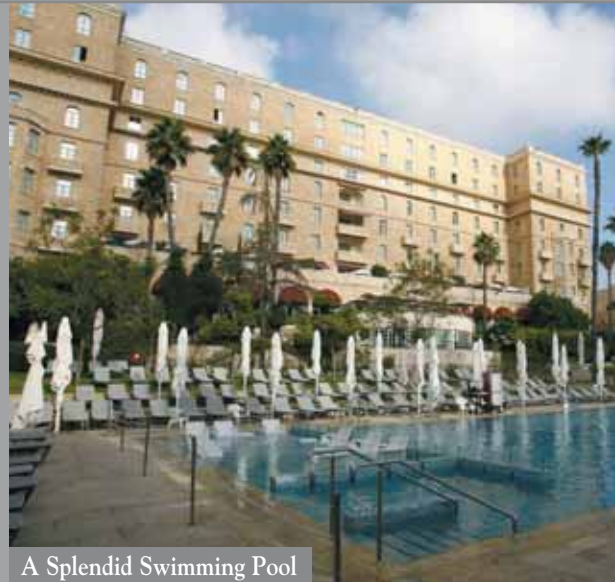
A Splendid Swimming Pool

Seminar Center with a main hall, accommodating up to 120 guests, with three smaller adjoining and connecting halls and a terrace overlooking the hotel gardens.