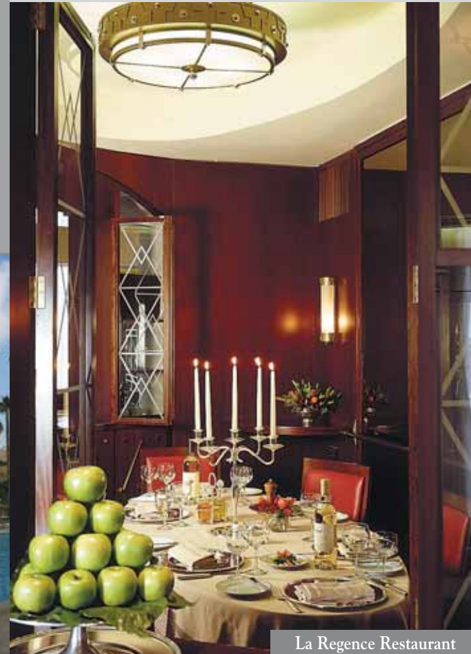
La Regence Restaurant