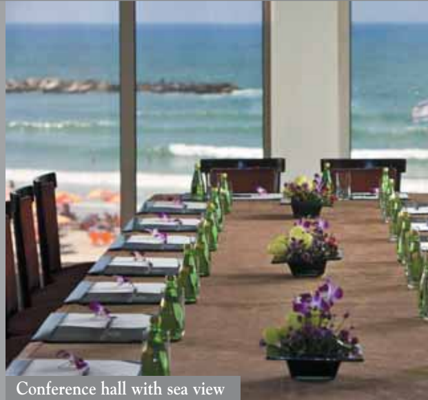
Conference hall with sea view

Guest rooms with cable T.V., Wireless Internet access in rooms and public areas, (fax upon request), in-room safe, minibar, hair dryer, bathrobes. 24-Hour room service. Express check-in/out. Complimentary daily newspaper. Free use of King David Crown Lounge, Butler Service for guests staying in Executive Sea View Rooms and Suites. Free guided bus tour every Saturday to historic sites and attractions.